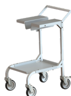
Cosmos Trolley, art nr 70347