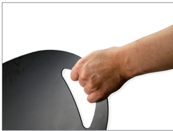
Ergonomically designed handles.