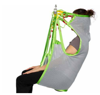
Silhouette Sling Polyester Net Art. Nr: 25015

The Silhouette Sling is a comfortable sling without reinforcements, handles or padding. It adapts to the patients body to offer good support for the entire body. The sling can be used in most lifting situations and is especially suitable for transferring to and from wheelchairs, molded seats or seating shells.