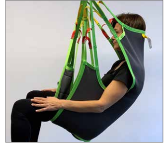
Silhouette Sling Soft Art. Nr: 25019

The Silhouette Sling is a comfortable sling without reinforcements, handles or padding. It adapts to the patients body to offer good support for the entire body. The sling can be used in most lifting situations and is especially suitable for transferring to and from wheelchairs, molded seats or seating shells.