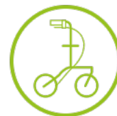
Table Pad Indoor / Outdoor Unique Handles