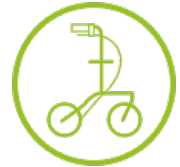
Table Pad Indoor / Outdoor Unique Handles